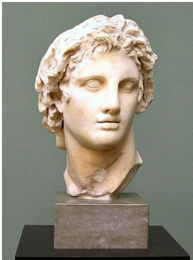
Image of Alexander the Great sculpture