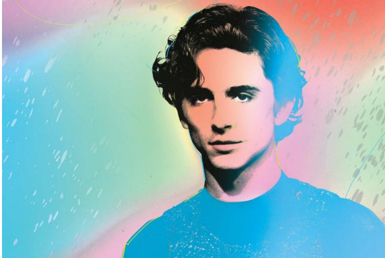
Example image of Timothee Chalamet showing expressive use of color and tone